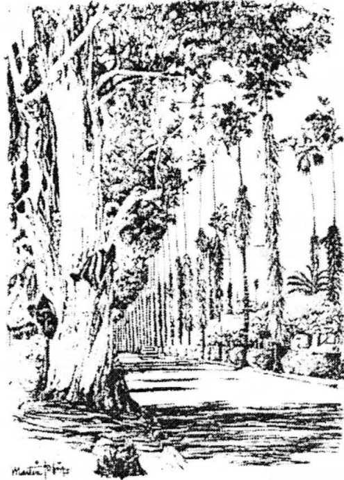
Victoria Avenue - Since 1892

_____ I approve the slate of officers and directors for VAF 2005 -2006